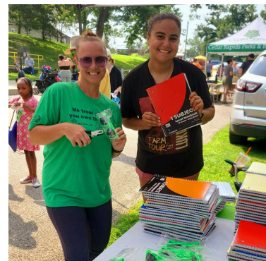
Staff and board members handed out notebooks and