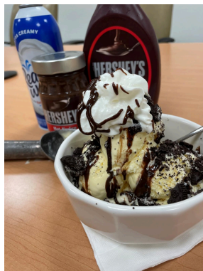
The Metco staff celebrated hot fudge sundae day on July